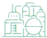
Hydroprocessed Esters & Fatty Acids (HEFA)

The vast majority of SAF produced today is through the HEFA process using fats, oils and greases. While a proven production process, the segment faces headwinds due to feedstock supply constraints and competition for the same inputs as the growing renewable diesel industry.