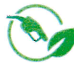
Emerging Technologies (Fischer-Tropsch & eFuels)

New technologies being developed for SAF include gasification and electricity to liquid fuels. Technological maturity, high capital & operating costs and large renewable energy requirements present challenges for large-scale deployment.