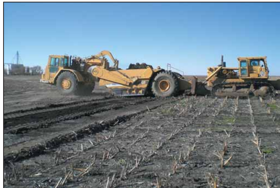
Dirtwork began at Missouri Valley Renewable Energy, LLC near Meckling, SD and Aberdeen Energy, LLC near Mina, SD earlier this month. Pictured is a scraper removing top soil at MVRE.