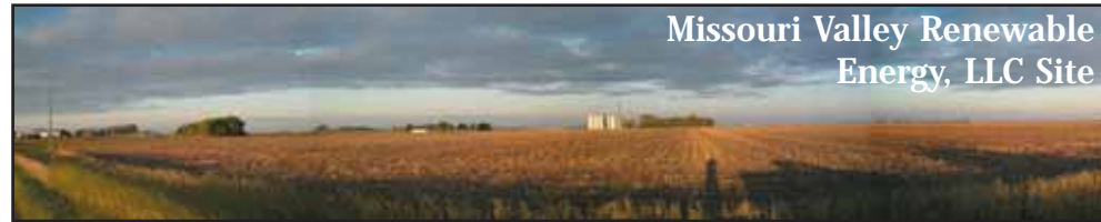
Missouri Valley Renewable Energy, LLC Site

As for the new plants we are building, we started to negotiate electricity and natural gas contracts. I anticipate having contracts in place by the first of the year. That will allow the various utility companies plenty of time to order and install the necessary facilities before the plants start operation.